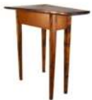
98: Tiger Maple Wing Table

Three framed and signed watercolor seascapes. Two are signed by Norma Tupper 1969 and 1971; the other signed Barun 1/12/68. Dimensions: Range from 15" Height x 22" Width to 23" Height x 28" Width